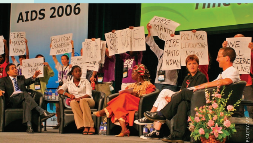
Down with Manto. Activists take the stage during a session on “The Price of Inaction” to protest the policies of South Africa’s health minister.

The last word came from the journalist Laurie Garrett. “A lot of science writers do overly rely on the journals and basically translating things straight from the journals without much critical analysis,” she admitted. But she sympathized with Geffen’s description of “utter drivel that’s published daily” in South Africa. “For us in North America, it’s almost an intellectual debate,” she said. But at the conference “we’re trying to globalize this discussion and take it out of the comfortable place of Toronto into something larger”—into a place where it is a matter of life and death. JCB