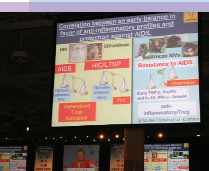
Slow down. Françoise Barré-Sinoussi, codiscoverer of HIV, explains the detrimental effects of excessive immune activation.