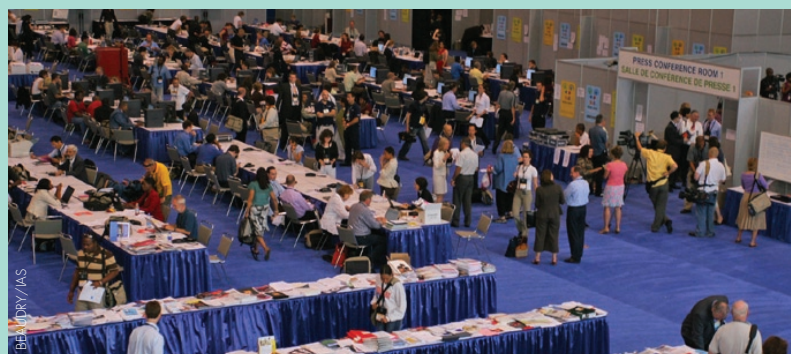
Imperfect messengers. Occupants of the bustling press room at the AIDS conference must decide how much to challenge HIV researchers.

Scientists must be challenged, but not at the expense of accepted theories.