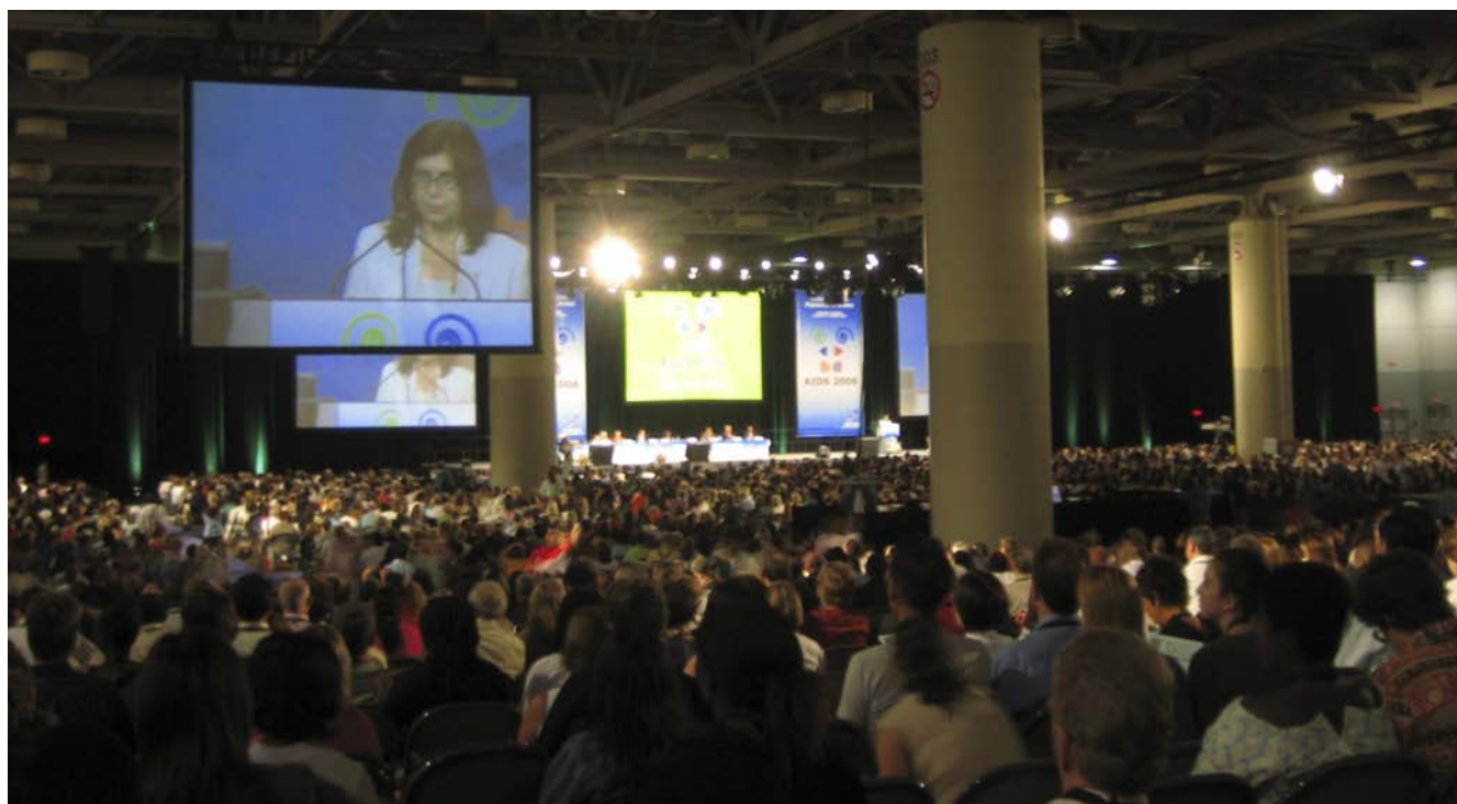
Packing them in. Approximately 24,000 people, from activists to scientists, attend the AIDS conference.

and those that cannot change because doing so would make the virus inviable. The latter group of epitopes would make good targets for a vaccine. But when Christie looked at some epitopes that do not normally mutate, and deliberately mutated them in vitro, she found that the resulting viruses were perfectly viable.