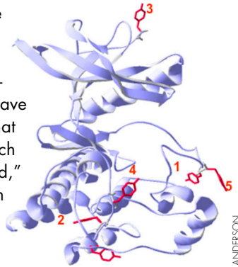
Five phosphorylations of the FGF receptor occur in a strict order.

Reference: Furdul, C.M., et al. 2006. Mol. Cell. 21:711–717.